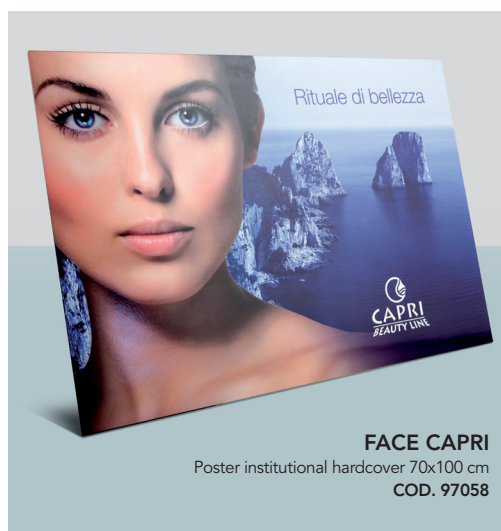
FACE CAPRI Poster institutional hardcover 70x100 cm COD. 97058