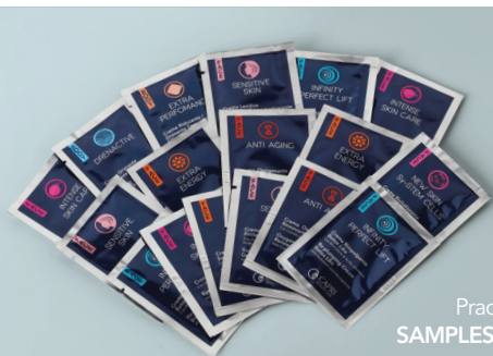
Practical and captivating SAMPLES (No. 10 References)