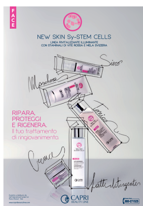
NEW SKIN Sy-STEM CELLS COD. 97062