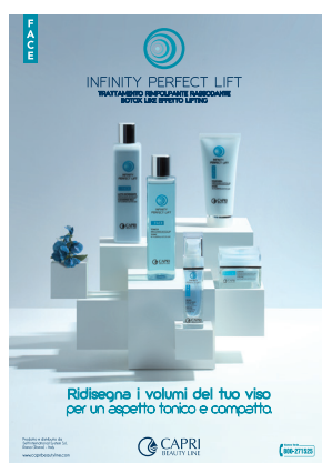
INFINITY PERFECT LIFT COD. 97061