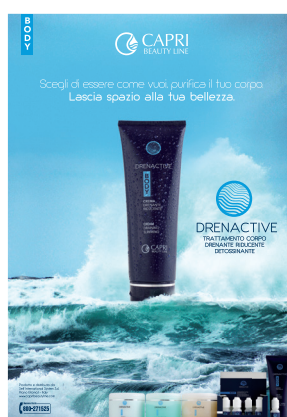
DRENACTIVE COD. 97064