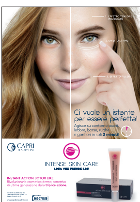
INTENSE SKIN CARE COD. 97063