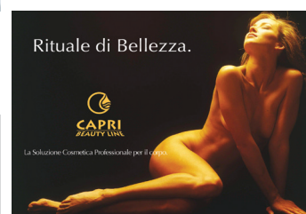
BODY POSTER Poster plasticized 50x70 cm COD. 97055