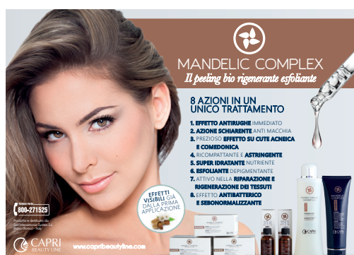
MANDELIC COMPLEX POSTER Poster plasticized 70x100 cm COD. 97066